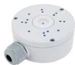
SN-CBK656A Junction Box